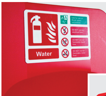
Dedicated signage space