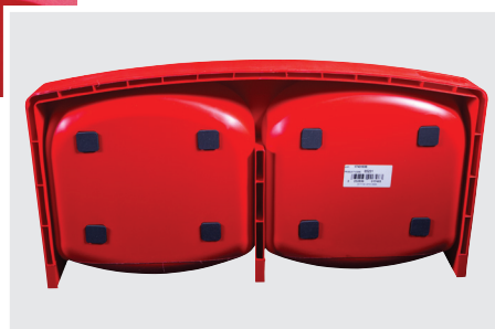
Grips for a more secure set up