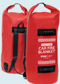
6m x 8m single-use or multi-use Fire Blanket

Protect against large lithium-ion battery fires with a combination of LFX Fire Extinguishers and a large Lithium-Ion fire blanket.