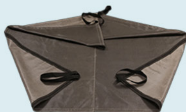
FireShield Heavy Duty Fire Blanket