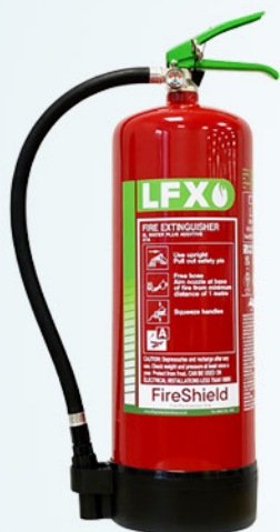
Product Code: FPS/LITH002