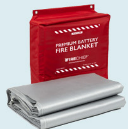
3m x 3m Premium single-use or multi-use Fire Blanket