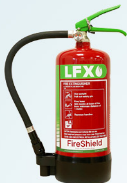
Product Code: FPS/LITH001