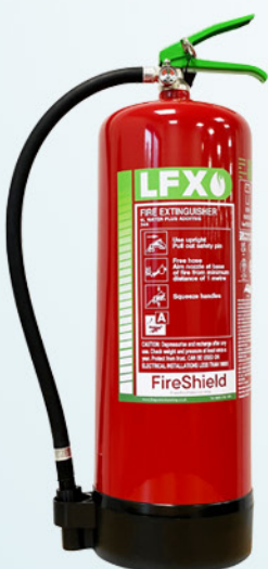
Product Code: FPS/LITH003